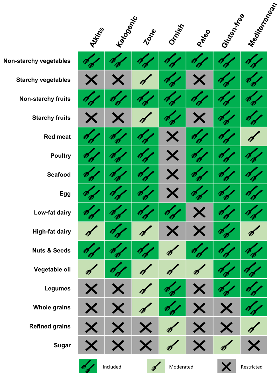
Fig. 1. Food groups included or excluded in popular diets: Atkins, Ketogenic, Zone, Ornish, Paleo, gluten-free, and Mediterranean.